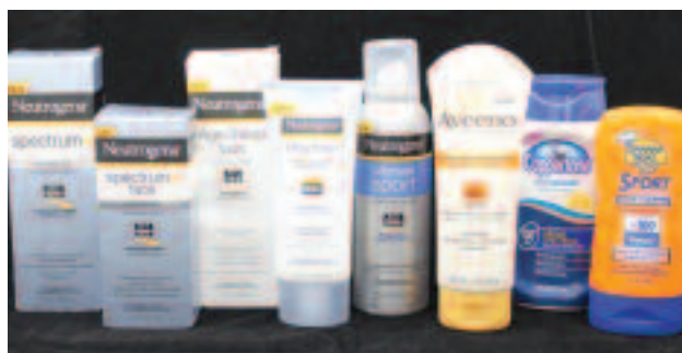
Commercially available SPF 100+ sunscreen products

Vitro Skin (N-19) 9 as alternative substrate instead of roughened quartz plates, which FDA proposed for the in vitro portion of its UVA test method while requesting comments regarding the suitability of other possible substrates. The suitability of Vitro Skin (N-19) as an alternative substrate for evaluation of UVAI/UV ratio was demonstrated by Dueva-Koganov et al. 10