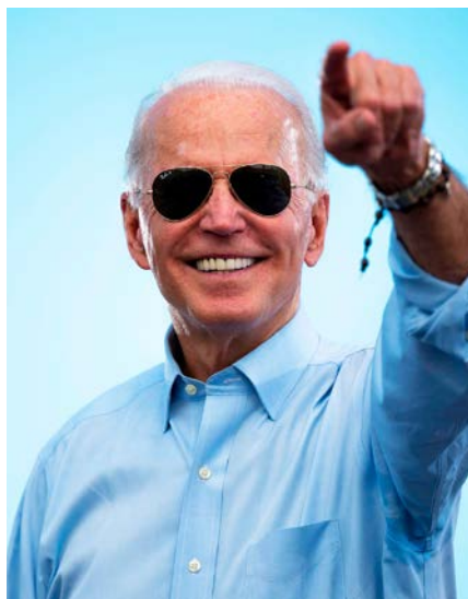
US President Joe Biden's cabinet picks will impact the sun care market.